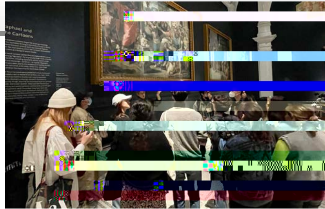
Digitisation students at the V&A