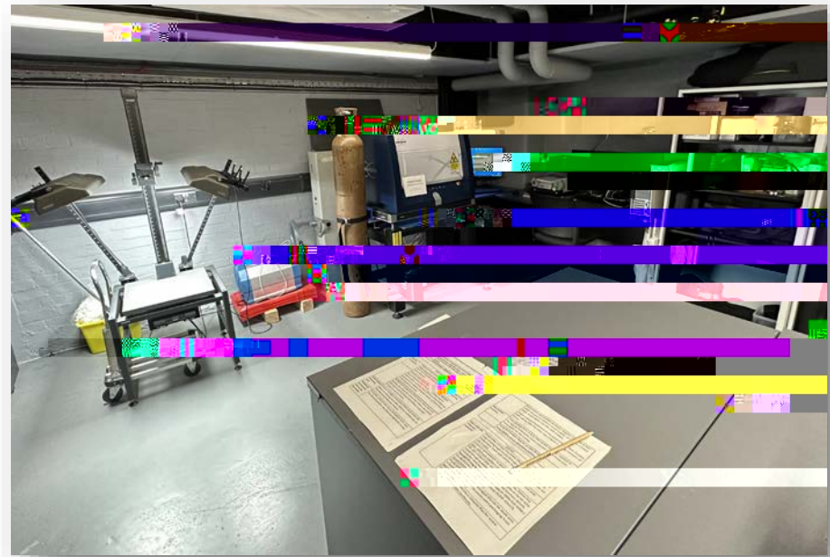
The UCL Digitisation Suite