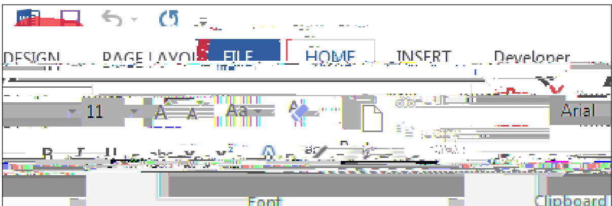
Fig. 2 Screenshot of the 'MS Word' programme - 'File' option